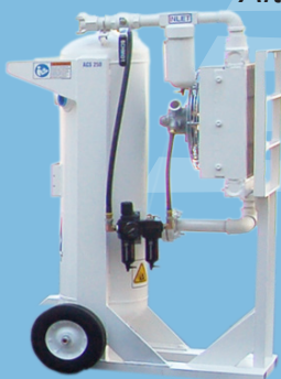
250 ACS Portable

System types are available to meet your specific requirements: Aftercoolers (ACS), Air Dryers (ADS) and Moisture Separators.