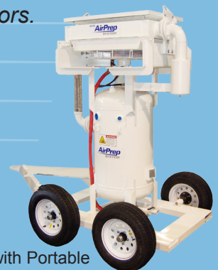
950 ACS with Portable Option