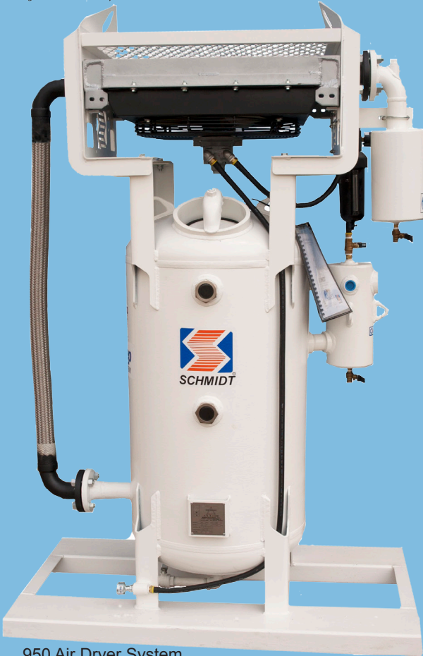
950 Air Dryer System (ADS)