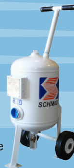
800 cfm Moisture Separator