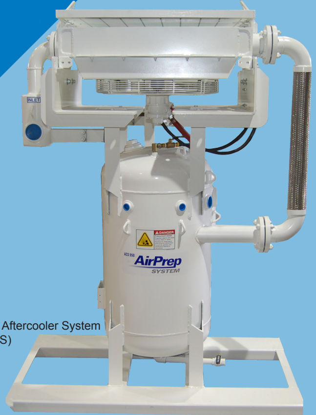
950 Aftercooler System (ACS)

Schmidt AirPrep Systems (Aftercoolers/Air Dryers/Moisture Separators) effectively provide cooler, cleaner and drier air to your blasting system while maintaining negligible drop in pressure.